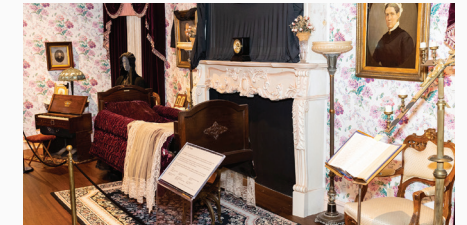
19TH CENTURY MOURNING