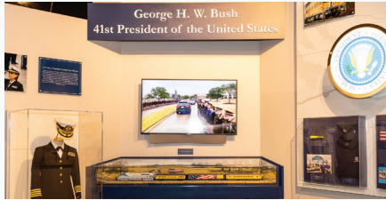
GEORGE H. W. BUSH MEMORIAL EXHIBIT

IT'S SCIENCE. IT'S CULTURE. IT'S HISTORY.