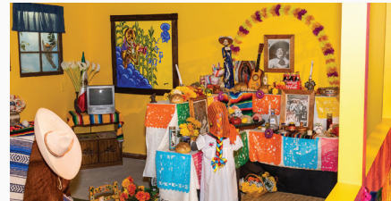
DAY OF THE DEAD / DÍA DE LOS MUERTOS