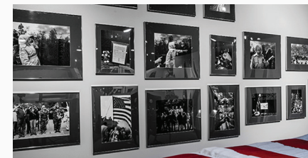
REFLECTIONS ON THE WALL