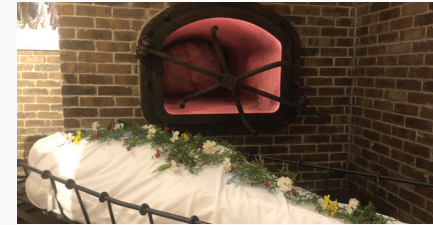
THE HISTORY OF CREMATION