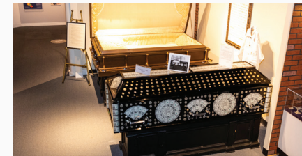
COFFINS AND CASKETS OF THE PAST