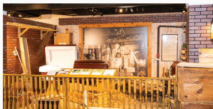
MARSELLUS CASKET COMPANY