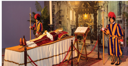
CELEBRATING THE LIVES AND DEATHS OF THE POPES