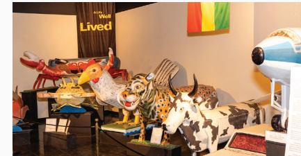
A LIFE WELL LIVED: FANTASY COFFINS FROM GHANA