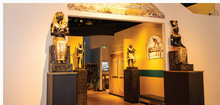
HISTORY OF EMBALMING