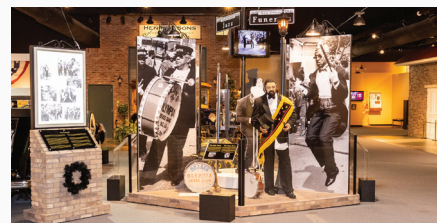
JAZZ FUNERALS OF NEW ORLEANS