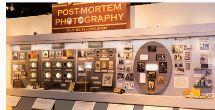
HISTORY OF MOURNING PHOTOGRAPHY