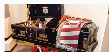
9/11 AND FALLEN HEROES TRIBUTE