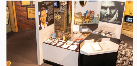
THANKS FOR THE MEMORIES