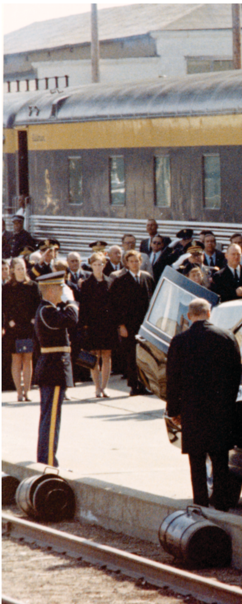
Right: At 6:45 p.m. on April 2, 1969 the Eisenhower funeral train arrives in Abilene, Kansas.

Many people placed pennies on the track to be flattened by the funeral train as souvenirs.